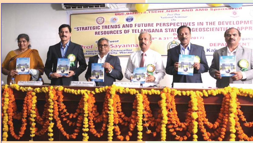
Release of seminar souvenir