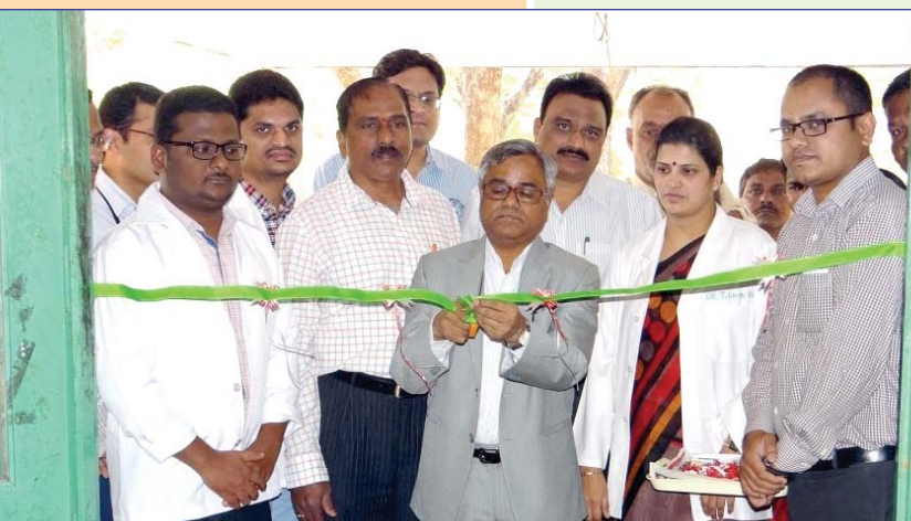
Inauguration of Free Health Camp