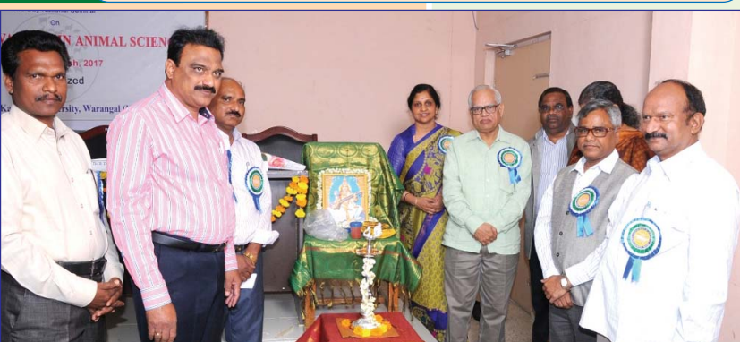
Inauguration of seminar on "Recent Innovations in Animal Sciences"