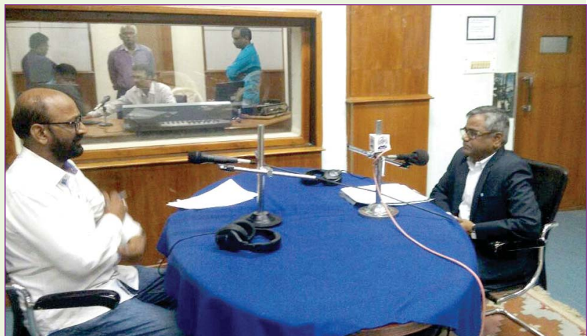
VC in an AIR Phone-in programme