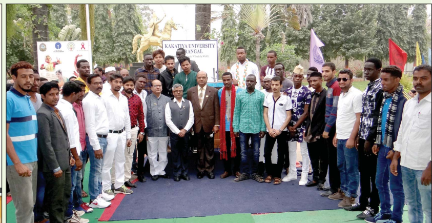
Foreign Students at Republic Day celebrations