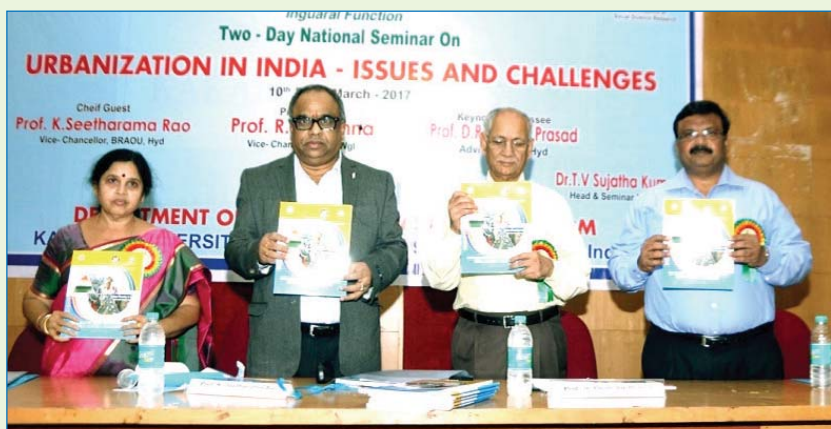
Release of Souvenir