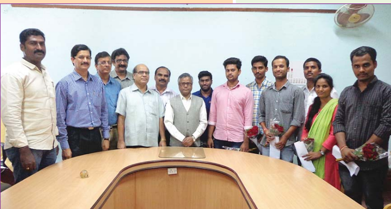
Geology dept. students selected for Mining Data Analyst Posts