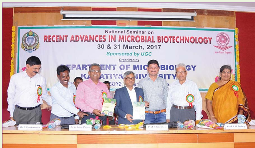
Release of Souvenir