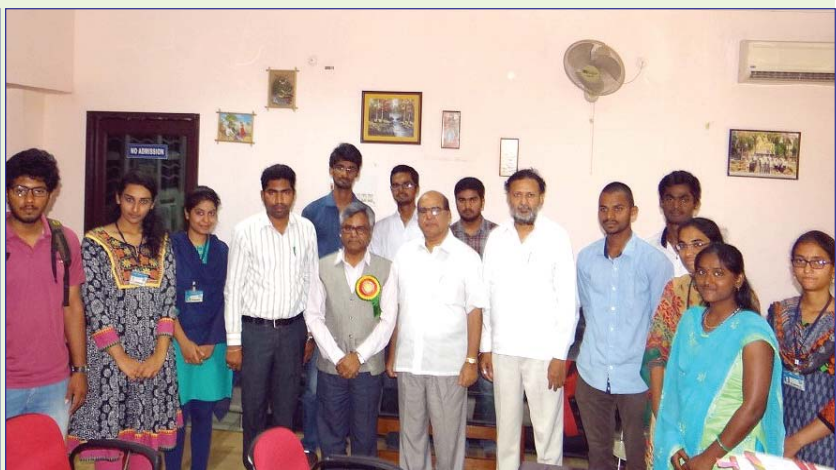
VC with students of KU College of Engg. & Tech. selected for jobs in campus placements