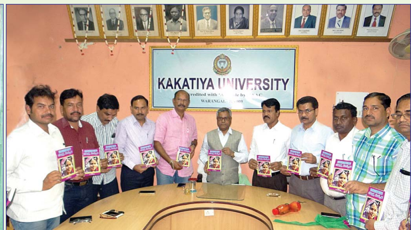
Release of book "Banjara Charithra - Samskruthi"