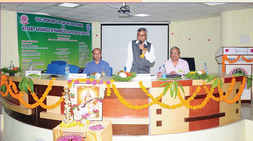
VC addressing at the seminar on "Recent advances in Pharmaceutical Sciences"